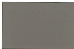
Slate Gray (SG)