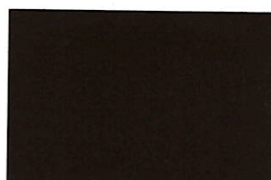
Dark Bronze (DB)