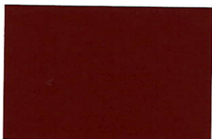
Colonial Red (CR)