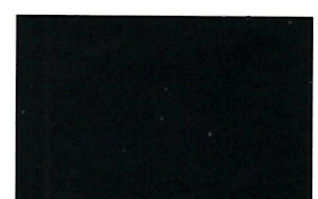
Matte Black (BL)