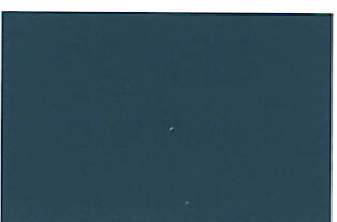
Gallery Blue (GB)