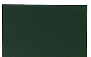
Hartford Green (HG)