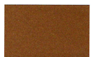
Copper Penny (CP)